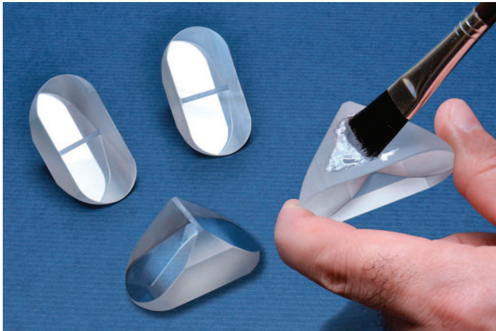
Master Bond LED401 adhesives cure quickly and tack free under safe, low-cost LED light sources.

Environmentally Friendly Light Cure Adhesive Improves Safety, Lowers Cost